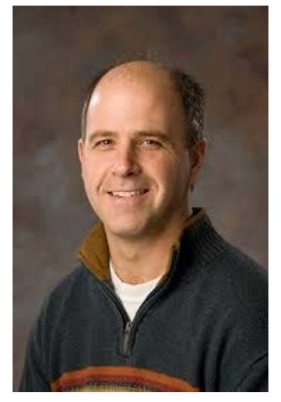
The courage to teach integrity and teach with integrity